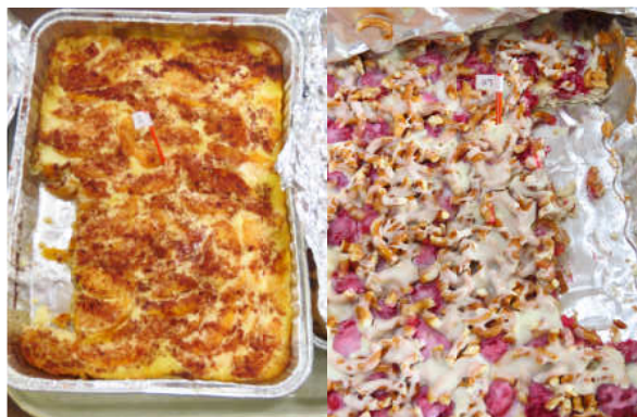
2016 First Prize winning Kuchens