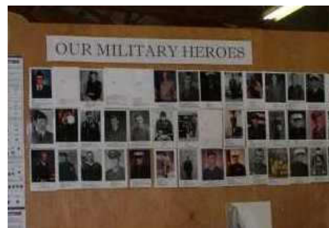
Family Members that have Served in the Armed Forces.