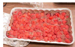
2013 First Prize winning Kuchens

Be Sure to Thank all the Volunteers that Make the Reunion a Success!