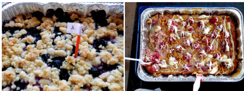
2015 First Prize winning Kuchens