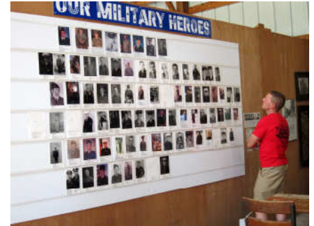
We have improved the Military Heroes Wall ! Send in your military information and picture.

Please complete the form for each military person in your family. This should include your spouse, children, parents, grandparents or great grandparents, etc. if they served this country. Submit a picture of yourself or them in military uniform. This information will be displayed on the “Military Hero Wall” at the Reunion. Send to: Seidemann Family P. O. Box 184 Newburg WI. 53060-0184 or email secretary@seidemannfamily.org .